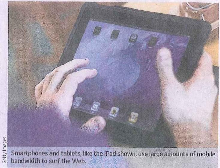
Smartphones and tablets, like the iPad shown, use large amounts of mobile bandwidth to surf the Web.

* An exabyte is one billion gigabytes. Source: The Mobile World